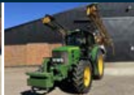
LOT: 72 & 69