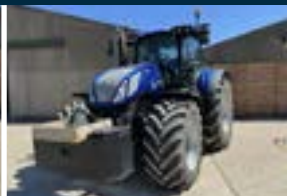
LOT: 74 & 16