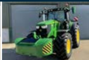
LOT: 273 & 275