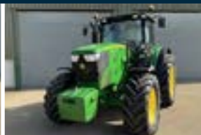
LOT: 272 & 278