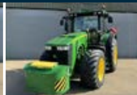
LOT: 274 & 276