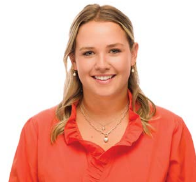
India Norwood Land Agency, Placement Student Leicester office

We have welcomed 12-month placement/sandwich students to our Firm for many years, as we understand the importance of the additional experience gained during this time enables you to determine which area of the profession you would like to focus on after your degree. Students have the option of working for up to 12 months in one office with one team, or can request ahead of their placement to experience different office locations and even different departments, as an excellent way of gaining experience across the breadth of our services.