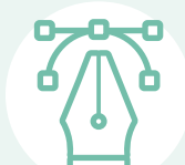
In house bespoke graphic design