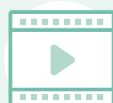
Professional video services