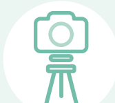
Professional photography services