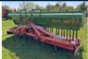
LOT: 157 & 158