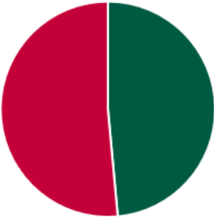
Upper Middle Quartile