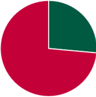
Lower Middle Quartile